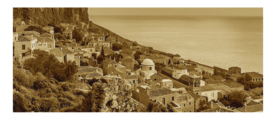
Fig. 2.4 Monemvasia

When Sparta is mentioned again, as showed by the abovementioned Life and Testament of Saint Nikos, it boasted local landowning elites who